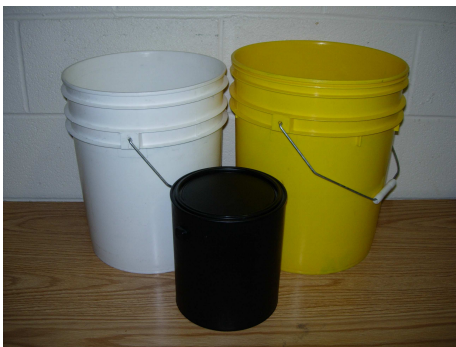
Possible container configurations