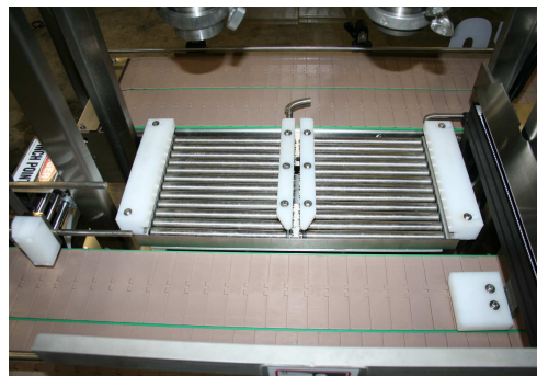
Minimal tooling change-over